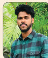
ASHID Otsen Technologies Pvt Ltd. Accounts Executive