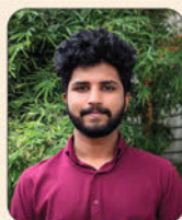
DILKAS Technologies Accounts Executive