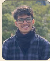
SABITH Interpath Business Consulting LLP Junior Analyst